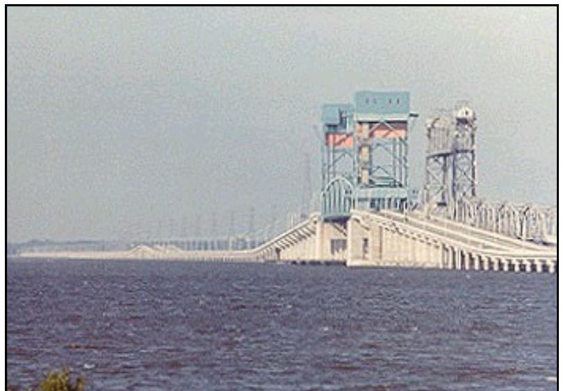
The Bridge in 1983 - photo by Scott Kozel

[ http://www.roadstothefuture.com/US17_JRB.html ]