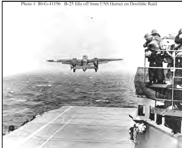
Photo # 80-G-41196 B-25 lifts off from USS Hornet on Doolittle Raid

[B-25 lifts off from USS Hornet on Doolittle Raid]