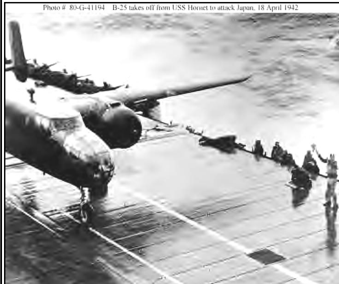
Photo # 80-G-41194 B-25 takes off from USS Hornet to attack Japan, 18 April 1942