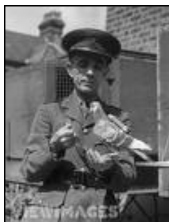
[British soldier with pi-

The U.S. Army used specially trained homing pigeons to carry messages during WWI and WWII. They were considered an undetectable method of communication. Fort Monmouth, New Jersey was the home of the U.S. Army Pigeon Breeding and Training Center from 1917 until 1957. A small capsule