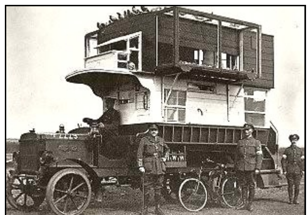
[WWI carrier pigeon roost]