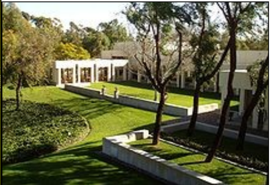
The National Academies' Beckman Conference Center, Irvine, California