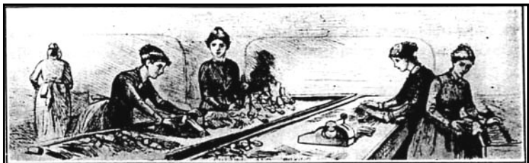
Cutting and Boxing Matches, U. S., 1878

“There is one difficulty attendant upon the manufacture of matches which makes it an employment to be shunned by those who are able to find some other means of subsistence. The acid fumes thrown off by the phosphorus during the various processes frequently cause among the people employed a terrible disease, which attacks the teeth and jaws. To such an extent did it prevail at one time in Germany that the attention of the government was called to it. The dippers are most likely to suffer in this way, in consequence of having to stand for hours over the heated slab upon which the phosphorus is spread. Persons with decayed teeth are most susceptible to this disease, and therefore they are carefully excluded from the factories. Indeed, the principle employees are young people of both sexes. No antidote has yet been discovered, and the natural course of the disease is to rot the entire jawbone away. This generally occupies several years., with a constant discharge of matter inside and outside the mouth. The pain is not very acute, but the sufferer seldom survives the natural course of the disease. Sometimes an operation is successful, and many have been performed at the New York Hospital. Sometimes it has been found necessary to remove the whole of the jawbone. Thorough ventilation and careful attention to cleanliness will